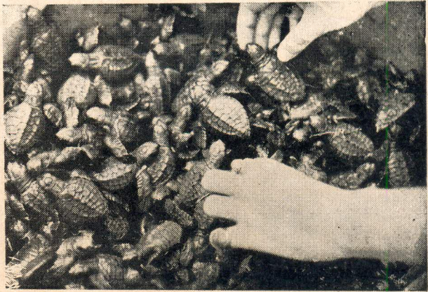
One day old hatchlings in a tub before being released into the ocean.