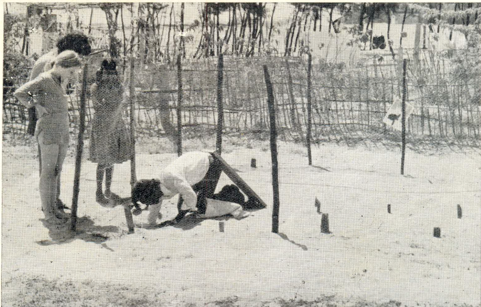
Above: Recording Ridleys nesting data on Madras beach. Below: First sea turtle hatchery in India.